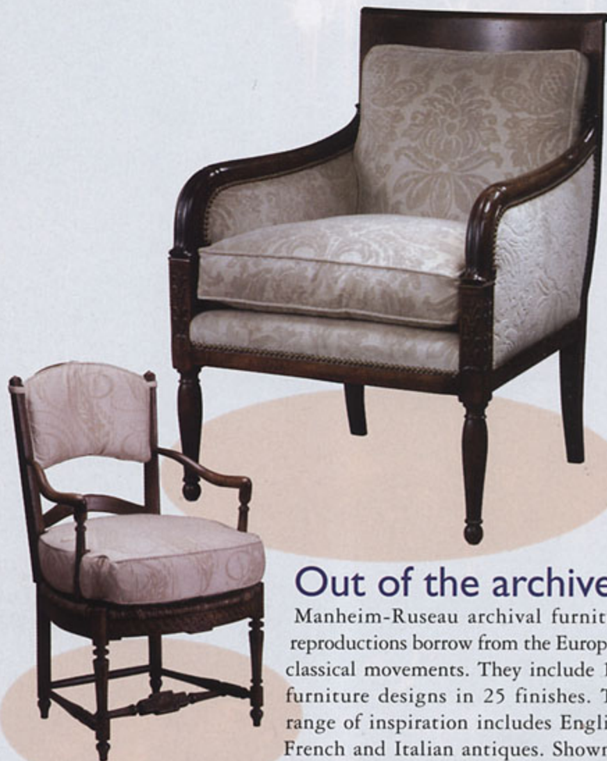
Provincial Arm Chair and Directoire Arm Chair from the Revisions collection. Through your designer.

Available in Hillcrest at TORREON IMPORTERS 1035 University Ave., S.D. 619-260-1035